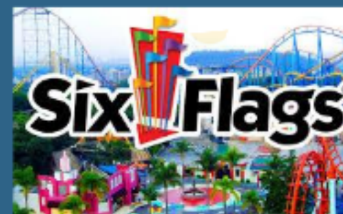
Six Flags on Friday