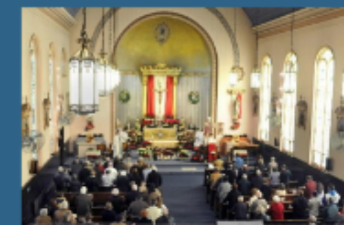
Church on Sunday